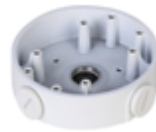
PFA139 Junction Box